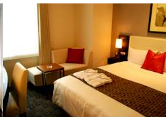
Deluxe Double Room