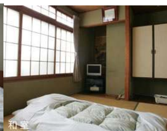
Japanese Style room