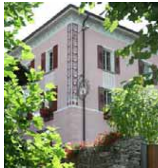
Hotel Al Cacciatore

2009 Event 1:8 I.C. Track 24-25.05 GP Open 06-07.06 Swiss CHAMPIONSHIPS 25-28.06 Warm-Up WORLD CHAMPIONSHIPS 11-12.07 GP Open 24-26.07 GP Open 13-23.08 WORLD CHAMPIONSHIPS www.rcworlds.ch